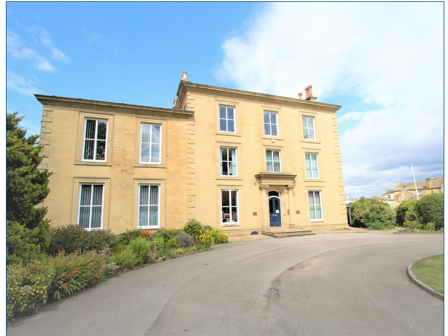
Leigh House, Varley Street, LS28 6AN

peter@stoneacreproperties.co.uk www.stoneacreproperties.co.uk